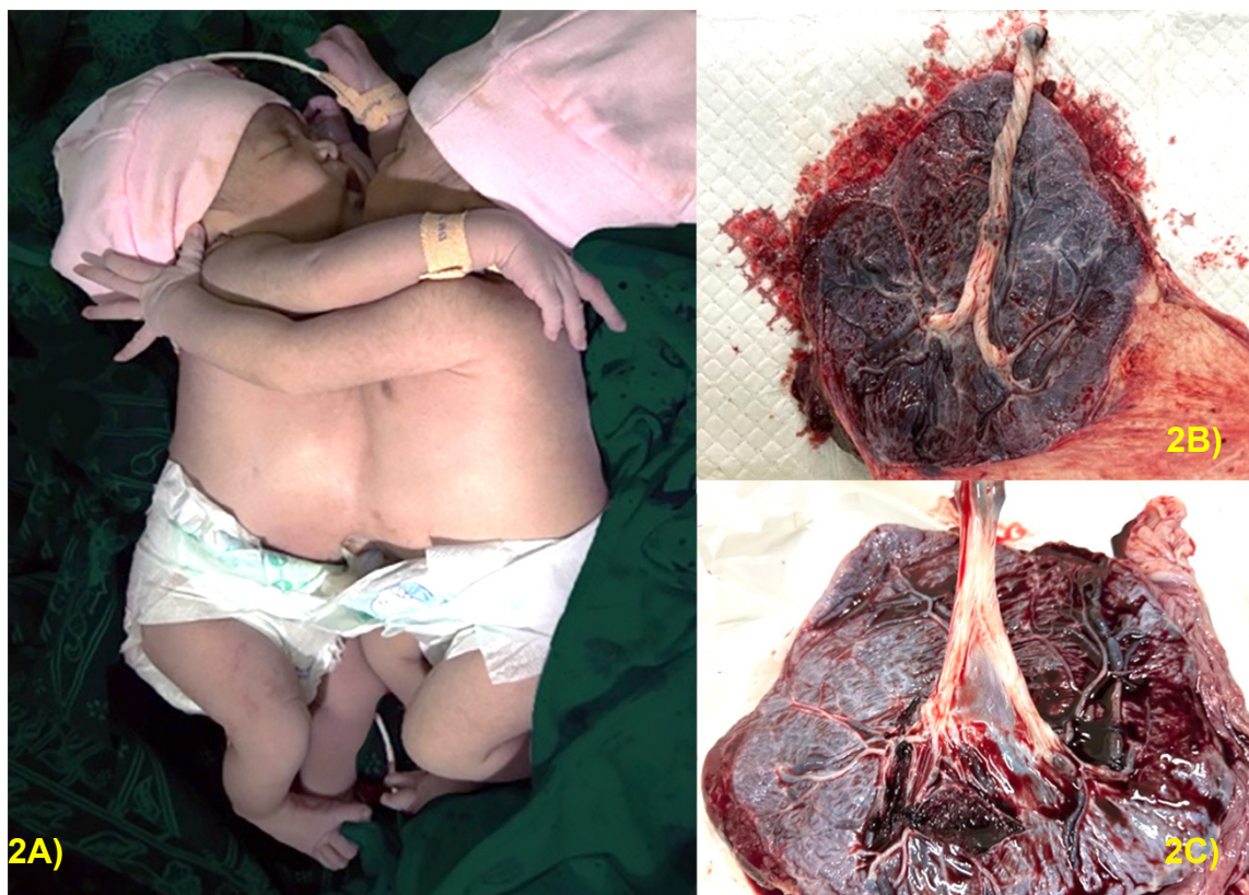
Figure 2 Thoraco-Omphalopagus Conjoined Twin in Stable Condition After Delivery.

A) Anterior chest and abdominal fusion in a thoraco-omphalopagus conjoined twin. B) A single placenta with an observable amniotic membrane without septum. C) A single umbilical cord attached to the fetal part of the placenta.