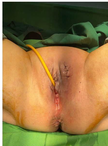
Figure 3 Left Vulvar Hematoma After Surgery

The wound was stitched layer by layer to reduce the risk of dead space. The outer wound was stitched using a simple interrupted technique with a polyglycolic acid suture. The wound was then dressed with framycetin sulfate dressing before being closed with gauze and transparent polyurethane fixation.