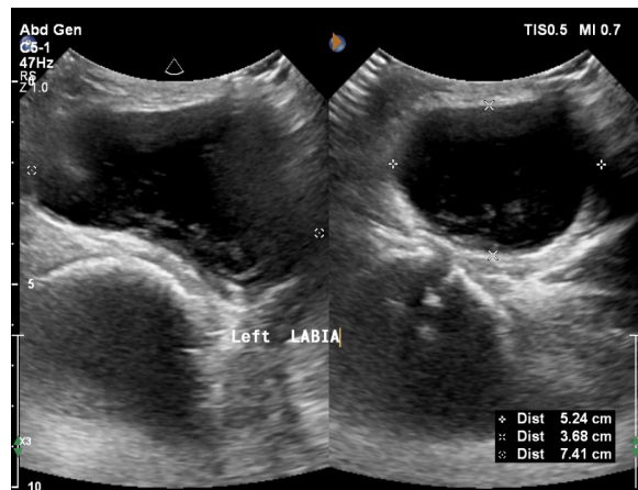
Figure 2 Left Labia Ultrasound

The patient was hospitalized and planned for surgery. Incision and clot evacuation of the labia was performed in the operating room under general anesthesia. An incision was made in the left major labia with a size of 3 cm. Approximately 50 ml of the liquified blood clot was removed, the cavity was irrigated, and hemostasis was achieved by suturing the bleeding point.