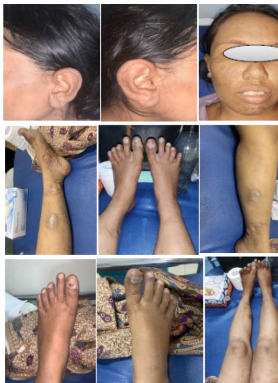
Figure 2 Hyperpigmented Patches Found on Dermatological Examination.