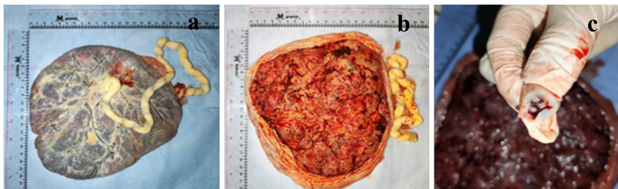
Figure 2 Placenta Macroscopy. a. Fetal Side of Placenta; b. Maternal Side of Placenta; c. Umbilical cord artery and vein

revealed blood pressure 176/101 mmHg, from fetal heart rate found the irregular (120 – 70 – 110 bpm). Her body mass index (BMI) before pregnancy was 22,5 m 2 /kg, which is normal, and she gained 12 kg during this pregnancy. From internal examination, we found that the 2-cm dilation with the cervix was thick and soft, the amnion membrane was still intact, and the head was at station 0.